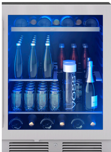
Zephyr Beverage Cooler