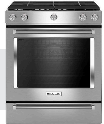
KitchenAid 30-Inch 5-Burner Gas Slide-In Convection Range