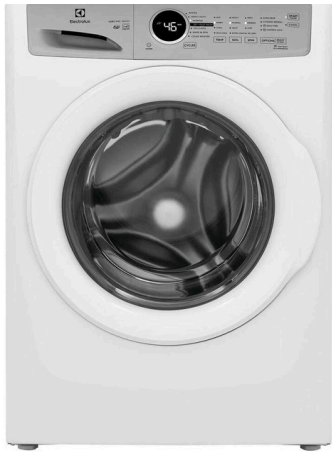
Electrolux Front Load Washer with LuxCare® Wash - 5.1 Cu. Ft.