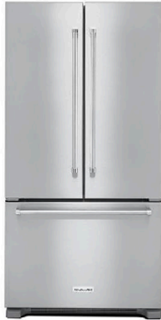
KitchenAid 22 cu. ft. 36-Inch Width Counter Depth French Door Refrigerator