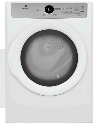
Electrolux Electric 8.0 Cu. Ft. Front Load Dryer