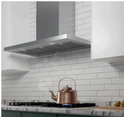
Trevesio Wall-Mounted Chimney Hood