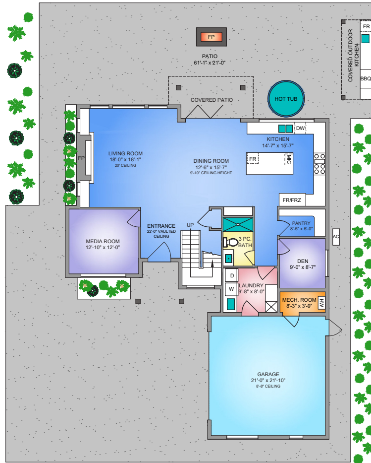
MAIN FLOOR 1536 SQ. FT. 8' CEILING HEIGHT