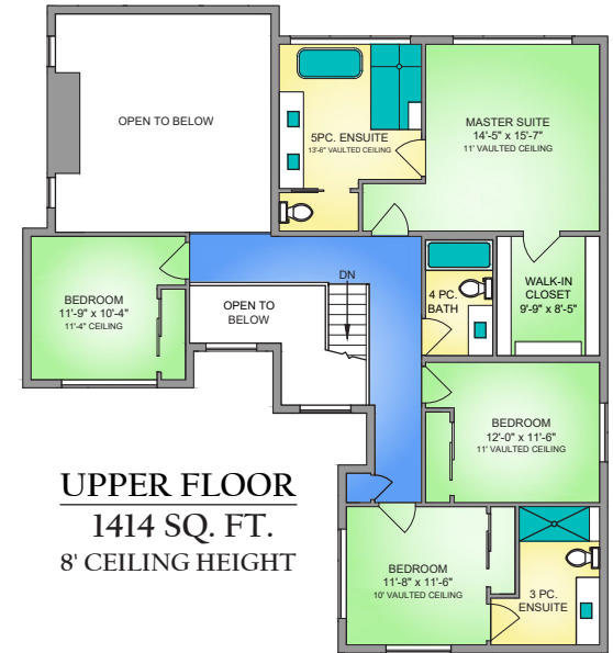
UPPER FLOOR 1414 SQ. FT. 8' CEILING HEIGHT