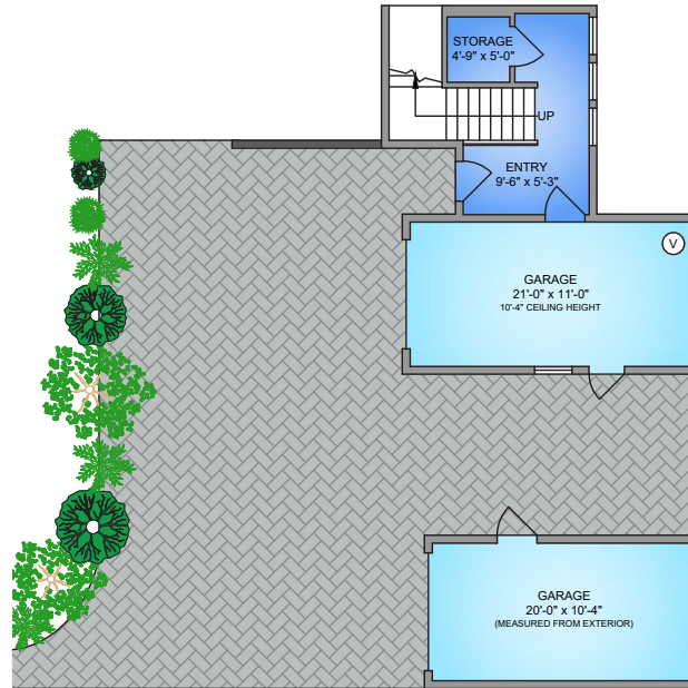
FIRST FLOOR 233 SQ. FT. 9'-8" CEILING HEIGHT

Garage 510 sq. ft. Balcony/Patio 785 sq. ft.