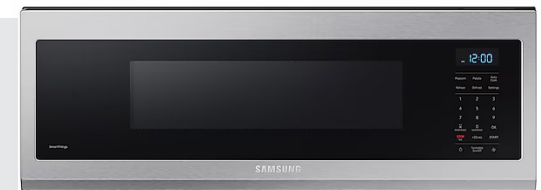
Samsung® 1.1 cu. ft. Smart SLIM Over-the-Range Microwave with 400 CFM Ventilation, Wi-Fi & Voice Control ME11A7510DS

*Features and finishings are subject to change at the developer's discretion*