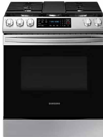
Samsung® Front Control Slide-in Gas Range with Convection NX60T8311SS