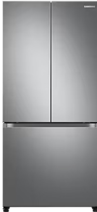
Samsung® 18 cu. ft. Smart Counter Depth 3-Door French Door Refrigerator RF18A5101SR