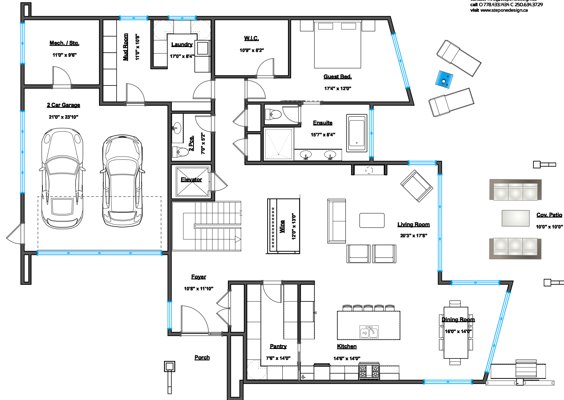
1 Main Floor Plan-Lot B Scale: 1/8" = 1'-0" 2129.54 sq. ft. (197.84 sq.m.)

PROPOSED RESIDENCE MICHIGAN PROPERTIES LOT B AMHURST AVE. SIDNEY B.C.